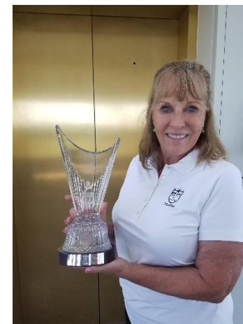
JAN STEPHENSON, WGHoF

GOLF FUNdraiser DAY OCTOBER 15 th , 2022